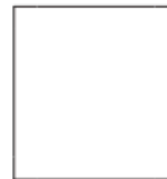
Photograph of alien removed

Port, date, and manner of removal: _____